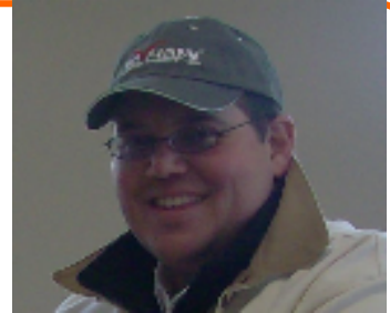
Building Relationships... One Handshake at a Time!

From a Main Street perspective, our priority is to make downtown Guymon a place that everyone wants to be. How do we do that? As an organization, we try several different techniques... from hosting special events with entertainment, to working with the businesses downtown to bring the people from the community into their stores. We know that the more people come here, the more likely they are to come back. We also know that we are just one piece of a much larger picture. At times it seems that the different organizations in Guymon are almost pitted against each other... that just isn't the case. Folks, we all have a part to play in making Guymon the place we want it to be... a better, safer, happier, more productive, more vibrant community! Come join with us!